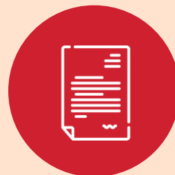
Other resources ( Letter to parents, certificates, pledge forms and more )