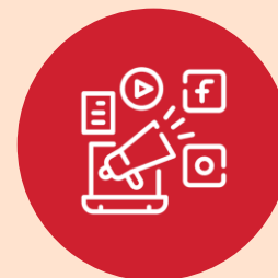
Social media tiles